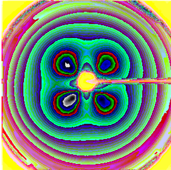
Fig. 2. False color image of polarization patterns on the surface of a beaker of a colloidal solution [21] of 2\mu\text{m} latex beads. Linearly polarized light is incident at a spot at the center of the image. The surface of the beaker is imaged with a camera through a linear analyzer. The analyzer is crossed with respect to the polarization of the incident beam. We see a clear four-fold symmetry in the intensity of the backscattered light with the maximum in inclined intensity at an angle of 45 degrees to the direction of the polarizers.

We use these remarks to understand recent rather elegant experiments [21] performed on colloidal solutions, motivated by problems in biological imaging. In the experiments a linearly polarized light beam is focused to a point on the surface of a colloidal solution. The surface of